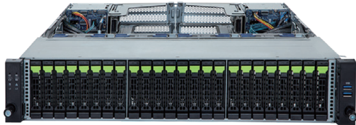
Mars 524 Ceph storage appliance