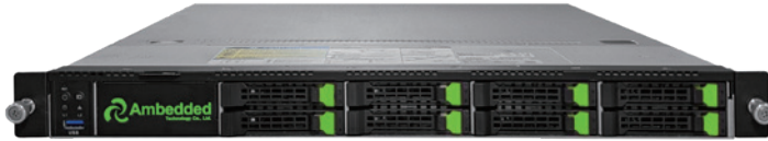
Mars 500 Ceph storage appliance